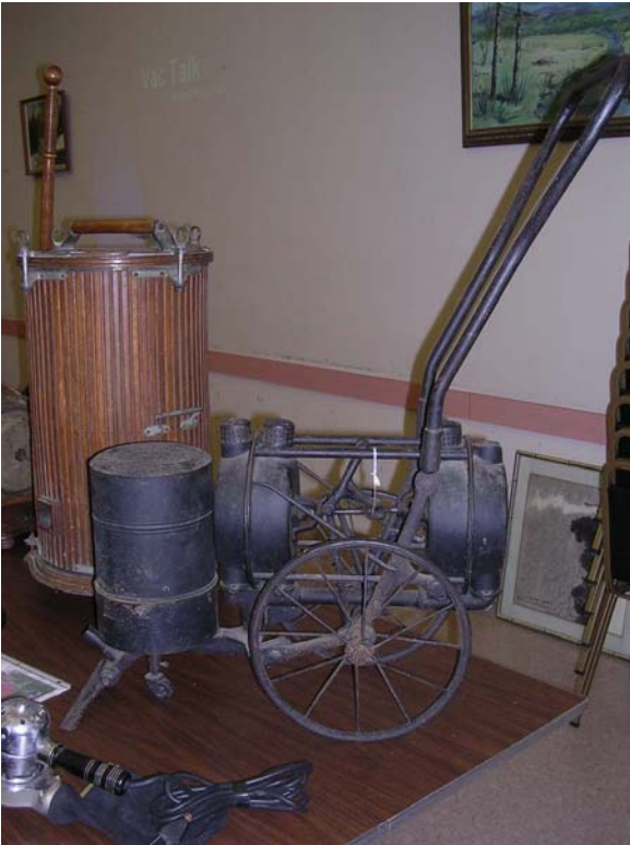
Yes, this is a vacuum cleaner! I just cannot recall what kind...

Vac technology did not change a lot and an English gentleman named Cecil Booth came up with a gas powered model in 1901. It was pulled on a large cart and remained outdoors while the hoses went inside for cleaning. He made a lot of money cleaning barracks for the Royal Navy as a lot of sailors were becoming infected with T.B. to the point that it was an epidemic, and the death rate dropped dramatically after Cecil's efforts pulled 26 truckloads of dust and dirt from the barracks (What ever happened to Ship Shape?). Queen Victoria was so impressed she had him present his device at state dinners.