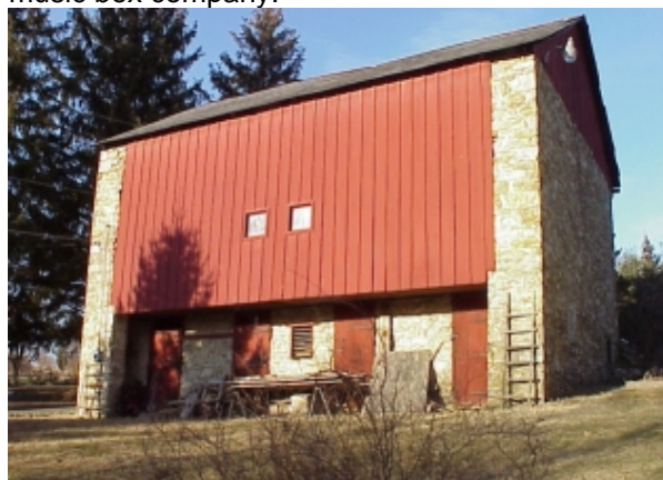
Where do you keep 1500 vacuum cleaners? In here!

Interestingly, it was Hoover and Henry Ford that figured out how to cast aluminum, a huge advance in making vacuum cleaners affordable and mass producible. Also of interest is that electric companies were thrilled with vacuum cleaners, as they increased the use of electricity and they often promoted vacuum cleaners. Another interesting tid bit – we all think that the first hand held vacuum (like the Dirt Devil) is a recent invention, but they were introduced back in 1915. Also of interest is that one of the original companies to make vacuum devices, Regina, was a music box company.