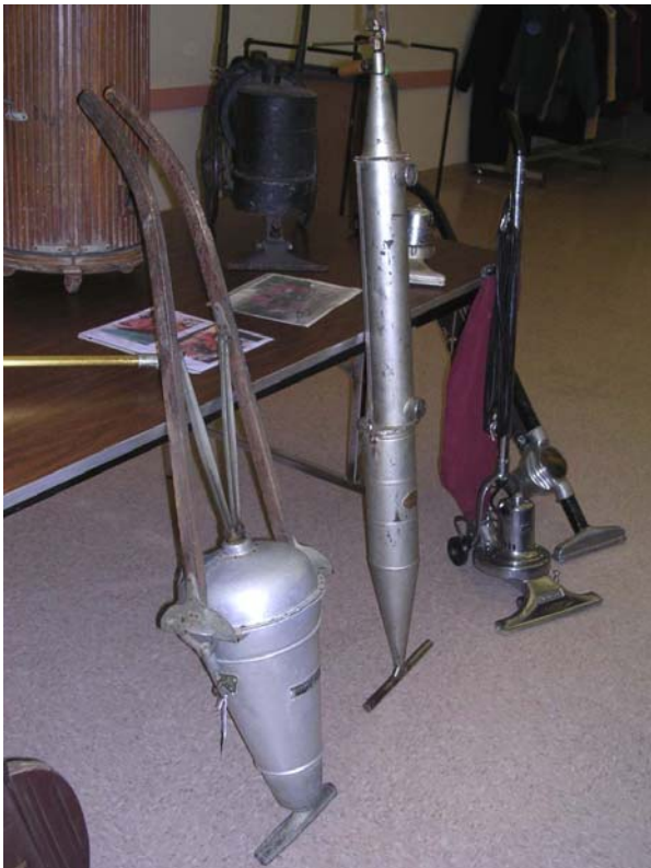
OK, we have a hybrid pumper style, a plunger style, and an early electric model here, left to right.