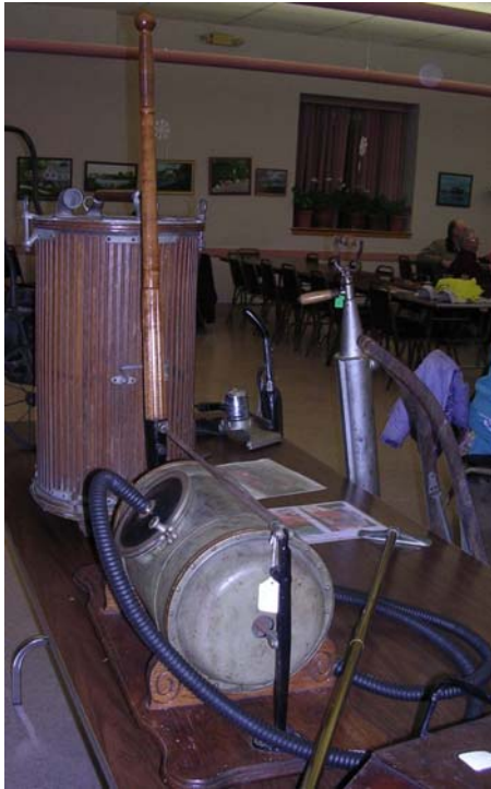
Two early vacuum models. The one in the foreground is known as a "pumper" where one person pumps the large handle and the other one operated the vacuum.

listen to this very interesting history. Bob's web site, www.vachunter.com , as stated earlier, is excellent. The sad part - it brought me back to a better time. Images of old Victorian homes, spotlessly kept in spite of all the hard work, families, folks who worked hard for what they had – images that are leaving our America. Thanks for a step back in time.