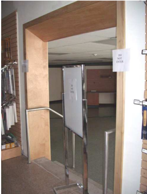
Archway connecting the two areas looking into Power Tool Alley. Hardly an alley! It is going to be a great browsing and buying place.

1. Contest – you need to fill out an entry form and get it to the store by April 23 rd . The categories are: