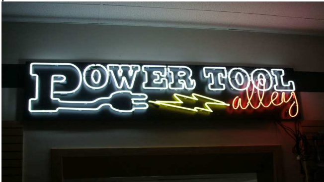
GREAT NEON SIGN! Invites us to Power Tool Alley!