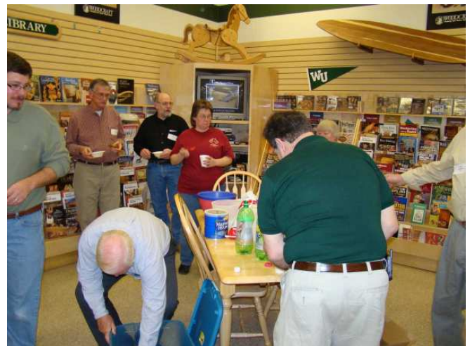
The readers corner in Woodcraft is a great refreshment area for our meetings.